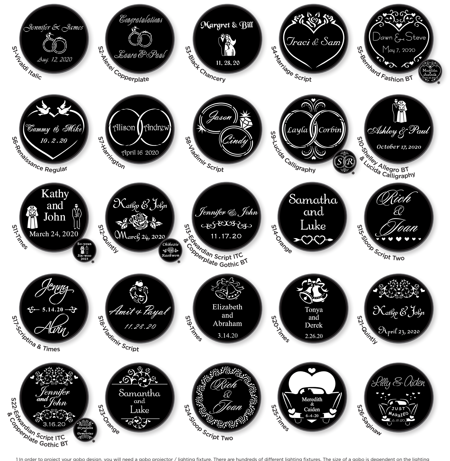
1 In order to project your gobo design, you will need a gobo projector / lighting fixture. There are hundreds of different lighting fixtures. The size of a gobo is dependent on the lighting fixture being used. Typically, venue, event coordinator, DJ or lighting designer provide the lighting fixtures. Ask them to provide the name and model of the fixture.

*Example of modifications to re-create pattern in smaller fixture